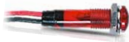
LED Indicator 276-270 "12V/20mAS 4mm Red LED with Holder" 9/32" (0.281") mounting hole

Toggle Switch, SPDT: Radio Shack 275-603, $2.99 LED Assy, Red: Radio Shack 276-270, $2.49