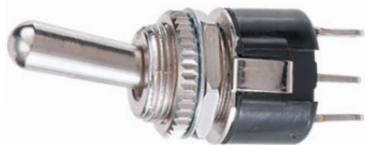
Toggle Switch 275-603 "6A 125V 3A 250V SPDT Heavy-Duty Switch" 1/2" mounting hole